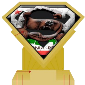
Custom 1 st Place Resin