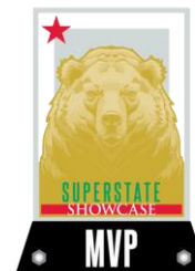
MVP each division