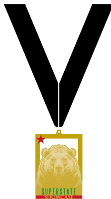
Custom Medal 1-4 th