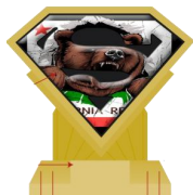
SS Showcase Trophy +