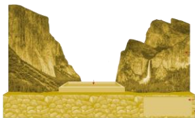
Varsity Base Resin Trophy