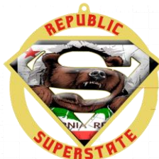
1st-4 th place medal