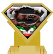
SS Showcase Trophy